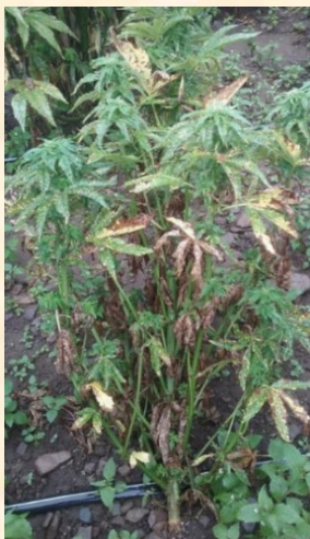
Fusarium Wilt on hemp

Several species of Fusarium infect hemp plants causing Fusarium wilt and Fusarium crown rot . Fusarium spp. result in systemic, vascular infections by infecting hemp roots, crowns and stems. These fungal pathogens persist on crop residue and in soil and spread through the movement of soil or airborne spores.