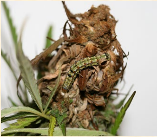
Corn Earworm on Hemp Bud, Photo by Stephen Komar