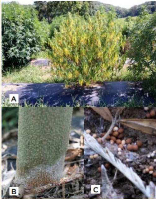
A) Plant in the field displaying wilt and leaf yellowing resulting from southern blight infection B) White fungal growth and tan/brown sclerotia are observed near the soil line on a hemp plant infected with southern blight. C) A close-up view of the hardy overwintering sclerotia, which resemble mustard seeds.