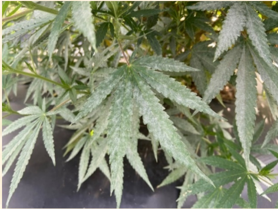
Powdery mildew.

Powdery mildew is a common foliar disease under high humidity conditions. In the 2020 hemp trials in NJ, Golovinomyces sp. was isolated from hemp transplants with powdery mildew and determined to be the causal agent locally. Many other states also report powdery mildew infections on hemp. Nearby hemp or cucurbit fields, as well as infected crop residue, may serve as inoculum sources. Greenhouse production favors powdery mildew infection due to higher humidity, reduced airflow, and moderate temperatures compared to field production.