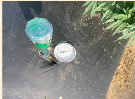
Tensiometer in the field displaying moisture levels in the root zone.

Test your soil several months (at least 6 months) before planting and apply lime and fertilizers as needed to obtain optimal optimum yields.