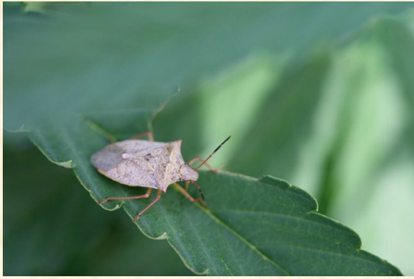
Stink bug on hemp leaf, Photo by Stephen Komar