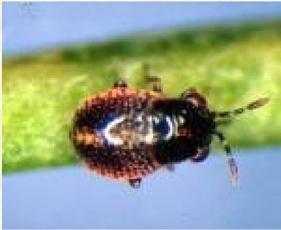
Big-Eyed Bug on a Stem

Natural enemies play an important role in the management of agricultural pests. Given the lack of approved pesticides and pesticide efficacy data on hemp grown in New Jersey, hemp growers may wish to encourage natural enemy populations to aid in biocontrol of pest species. Examples of these beneficial insects include Big-eyed bug ( Gercoris spp.), damsel bugs, Syrphid flies, Convergent Lady Beetle ( Hippodamia convergens L.), Minute Pirate Bug ( Orius insidiosus ), Green Lacewings ( Chrysoperla rufilabris L.), and Brown Lacewings ( Hemerobius spp.). More information on these species can be found here . For information on best management practices to encourage these beneficial insects on your farm, visit Michigan State University's Native Plants and Ecosystem Services website and check out ATTRA's publication: "Farmscaping to Enhance Biological Control."