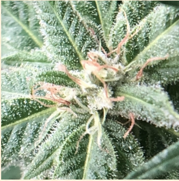
Clear trichomes on hemp plant