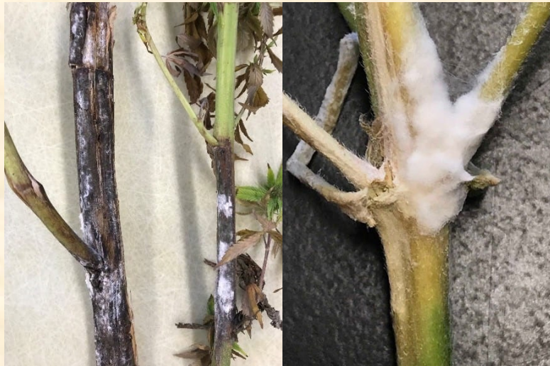
Sclerotinia White Mold

Sclerotinia white mold affects hemp stems and is best managed by crop rotation. However, white mold presents a management challenge because several crops and weeds are alternate hosts. Prevention requires good weed control, especially of broadleaf weeds, and a robust crop rotation schedule that avoids host crops such as soybeans, forage legumes, and many vegetable crops. Sclerotinia sclerotium is the causal agent of white mold and produces survival structures that can survive in the soil for 2+ years.