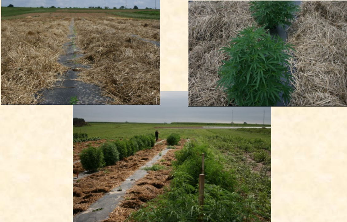
Straw mulch between rows for weed control, Photos by William Bamka and Stephen Komar

Prevent the arrival of new weed species by ensuring the use of weed free seeds or transplants and cleaning equipment prior to entering the field. Using both plastic mulch for in-row weed control and organic mulches, like straw, to prevent weeds between rows is recommended for hemp grown for CBD production.