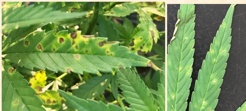
Septoria leaf spot

Leaf spots caused by fungal pathogens Septoria sp. and Bipolaris sp. was commonly observed in our 2020 hemp trials. Fungal leaf spots are widely reported in New York, Kentucky, and several other states where high disease impact has been observed. Even at sites where hemp had not previously been grown, leaf spot diseases were reported in NJ, so weeds are considered an alternate host. Leaf spot inoculum can also persist in the soil and on crop residue. Infection is favored by hot, humid weather following rain which can also spread inoculum through wind and soil splash. There are several other fungal genera that cause leaf spots on hemp.