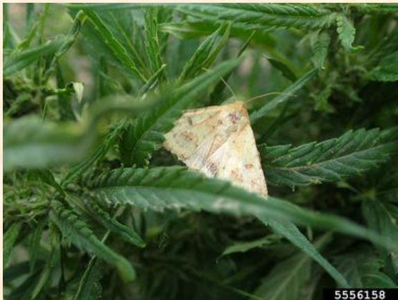
Corn earworm moth