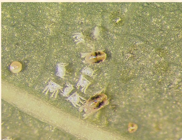
Two-Spotted Spider Mite