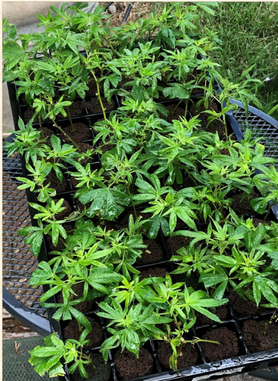
Hemp plants being prepared for transplanting