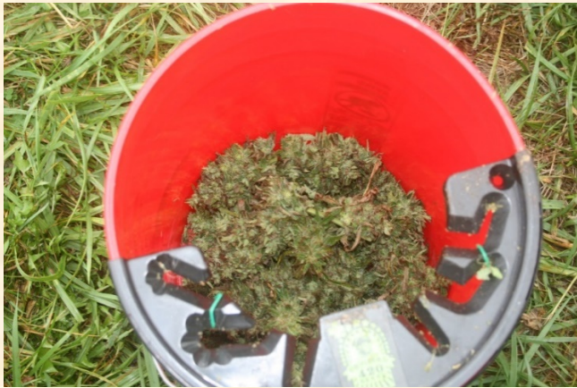
Bucket lid debudder for bud removal from stem