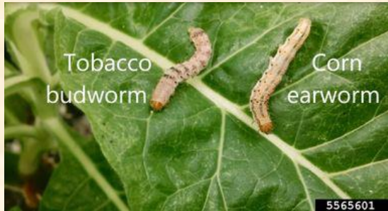
Tobacco Budworm and Corn Earworm Larvae