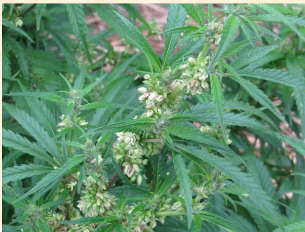
Male hemp plant, undesired in CBD hemp production, Photo by William Bamka

The time of harvest will depend on the variety, planting date, and growing region. Russetting (browning) of stigmas (white hairs) on buds will be one of the first indicators of bud maturation. After the change in stigmas is noted, attention should be focused on trichomes, which can be observed with a 60x hand lens. magnification. Trichomes will cover bud and leaf surfaces and appear as tiny stalks with bulbous heads. Throughout the maturation process, trichomes will range from clear to amber. Clear trichomes will be underdeveloped lacking full resin development, whereas amber trichomes will often be fully developed but on the verge of degradation. At harvest, plants can be dried before trimming or processed immediately once harvested from the field. It can be easier to trim buds and remove leaves on freshly harvested plants.