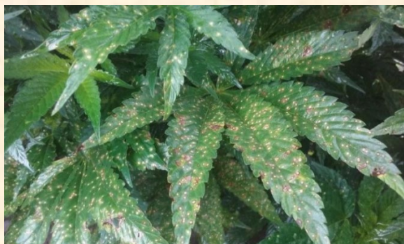
Bipolaris leaf spot