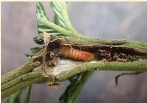
Eurasian Hemp Borer