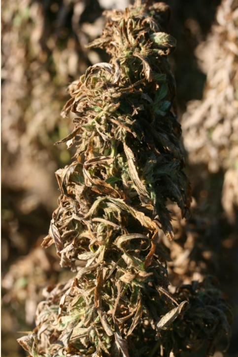
Fusarium bud blight, Photo by William Bamka

Fusarium bud blight occurs in female flower buds and grains and infection may result in contamination by Fusarium mycotoxins. There is much concern over this potential for contamination and work is ongoing to understand differences in varietal susceptibility.