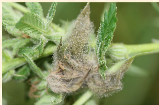
Botrytis gray mold, Photo by Stephen Komar

Botrytis gray mold is caused by Botrytis cinerea . Gray mold is favored by high humidity, poor airflow, and moderate temperatures. Infection is most common in flower buds but can be observed on all plant parts. Infection enters through a wound or opening in plant tissue. Reducing injury to plants and maximizing airflow in the plant canopy may reduce incidence of disease.