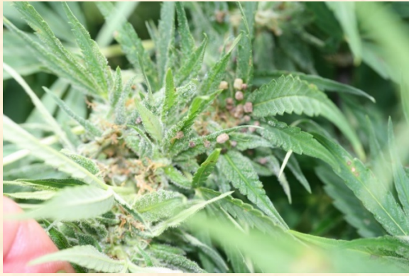
Frass (excrement) from corn earworm