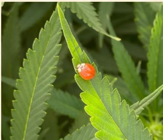
Lady Beetle