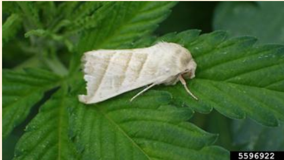
Tobacco budworm moth.