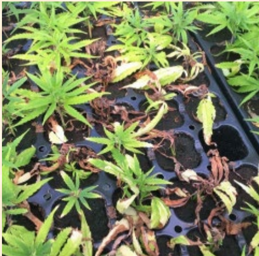
Damping-off in the greenhouse.

Damping-off is a phenomenon that occurs in seedlings, clones, and young transplants and is caused by Pythium spp. and Rhizoctonia solani . Damping-off is favored by wet soil conditions and high soluble salt content. Plants under stress are also more susceptible to infection. Infected plants will often exhibit characteristic wilting and often a lesion or girdling at the soil line. Good greenhouse sanitation is essential along with use of well-drained, disease-free planting medium. Use clean water and do not reuse planting medium to avoid introducing these pathogens. Discard infected plants and quarantine nearby plants.