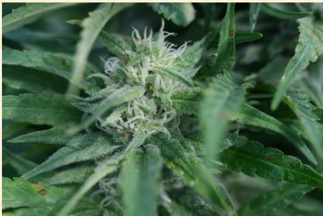
Immature bud and trichomes on a CBD hemp plant.